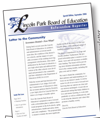
Referendum Reporter newsletter

The district compromised and made substantial cuts to the original referendum so that it included only the basics. Based on positive, transparent communications, residents developed a new confidence and realized that the board of education was offering just what the district needed to give their children a safe and healthy building and meet the state standards for education. The $2.1 million referendum was passed, along with the annual budget, in April 2007.